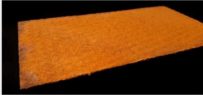
Weathered iron on MDF

Changing surfaces to real Weathered Iron